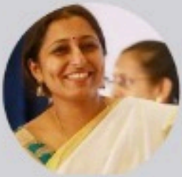
CA SMITHA V